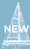
N505 CC NEXT GENERATION